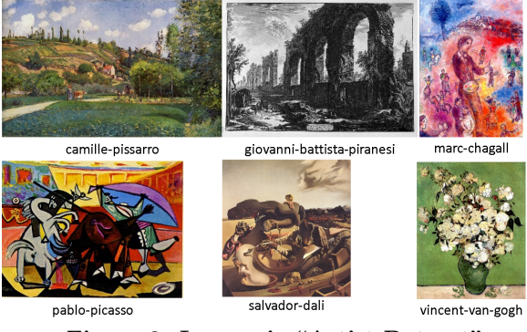
Figure 3: Images in "Artist Dataset".

the VGG-16 network [9]. In addition, we also examined the combined style vectors of all the five layers as well. Finally, we compared performance with Karayev et al. [5] using the same dataset.