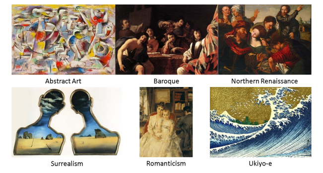
Figure 2: Images in "Style Dataset".

For experiments, we prepared an artistic pictorial image dataset which contains metadata on image style and artists by gathering them from Wikiart.org, and classified them with style vectors extracted from five intermediate layers (conv1_1, conv2_1, conv3_1, conv4_1, and conv5_1) of